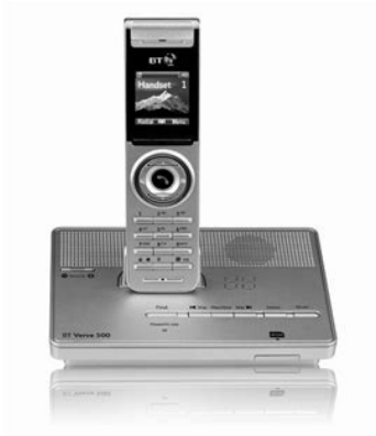
User Guide BT VERVE 500