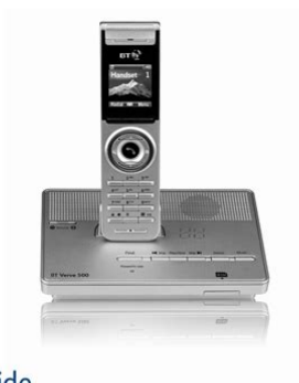
User Guide BT VERVE 500

Verve 500 - Issue 2 - Edition 2 - 19.10.06 - 7878